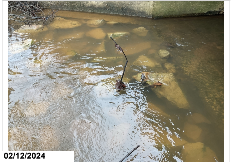
Rip rap used for scour protection at inlet ends