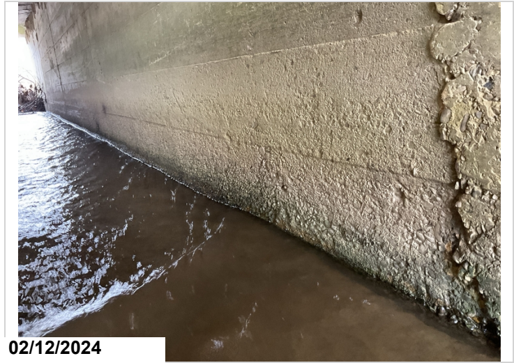
Barrel 1 abrasion. CS2