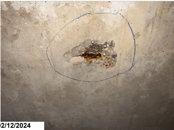
Barrel 2 exposed rebar. CS3