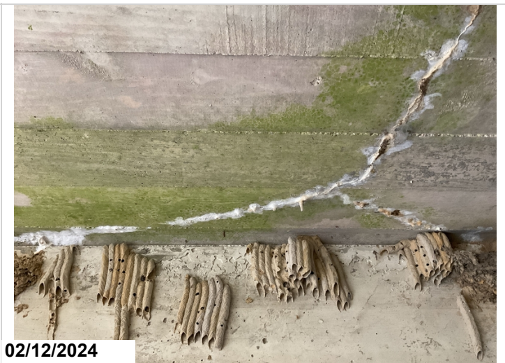
Barrel 1 efflorescence. CS2