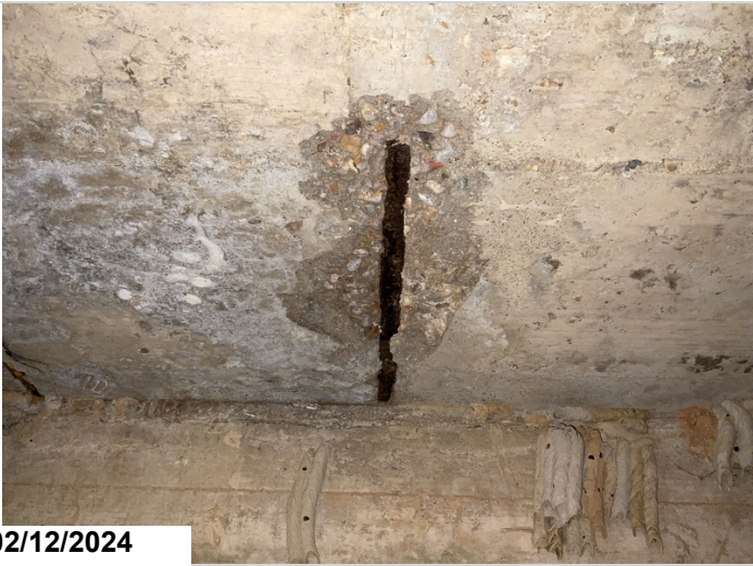
Barrel 1 exposed rebar. CS3