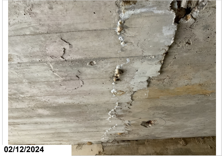
Barrel 2 efflorescence. CS2