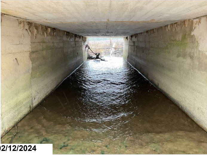
Typical through shot of box culvert