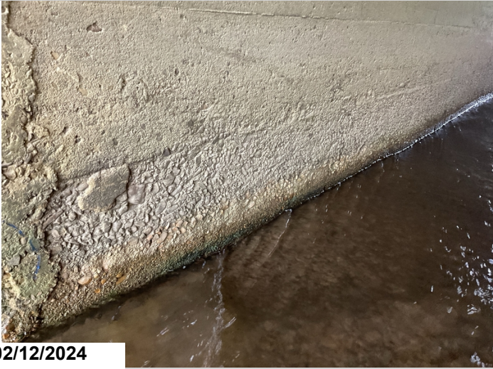
Barrel 2 abrasion. CS2