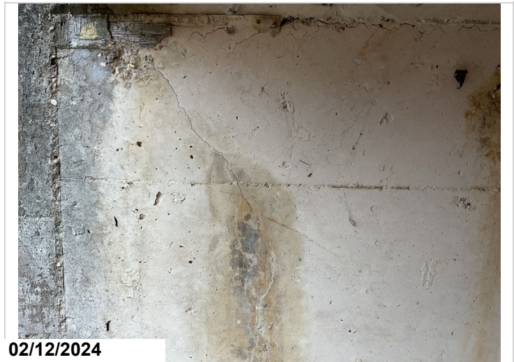
Typical cracking throughout both barrels 1 & 2. CS2