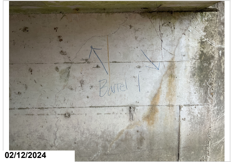
Barrel 1 cracking. CS2