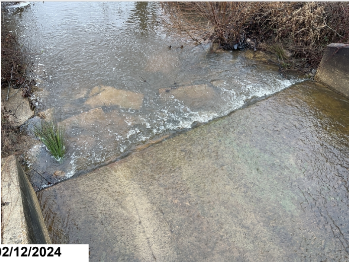
Outlet repairs for previous scour