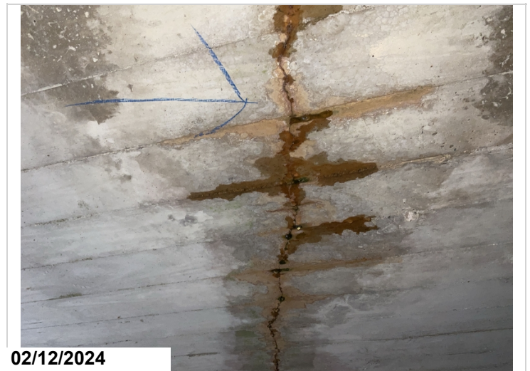
Barrel 1 efflorescence with rust staining. CS3