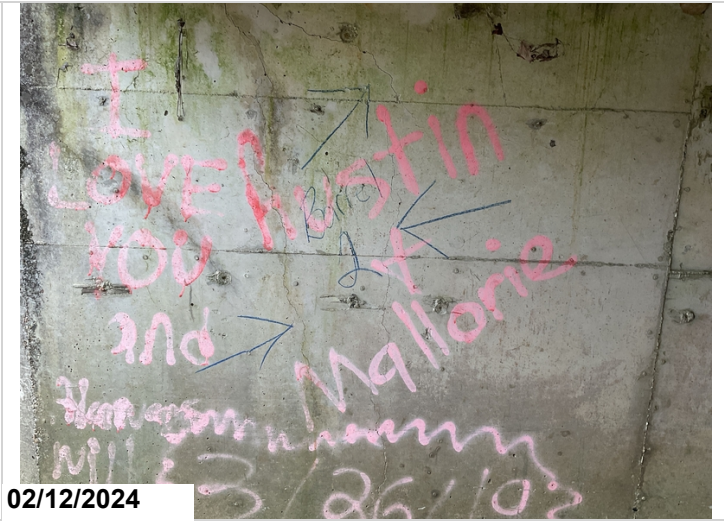
Barrel 2 cracking. CS2