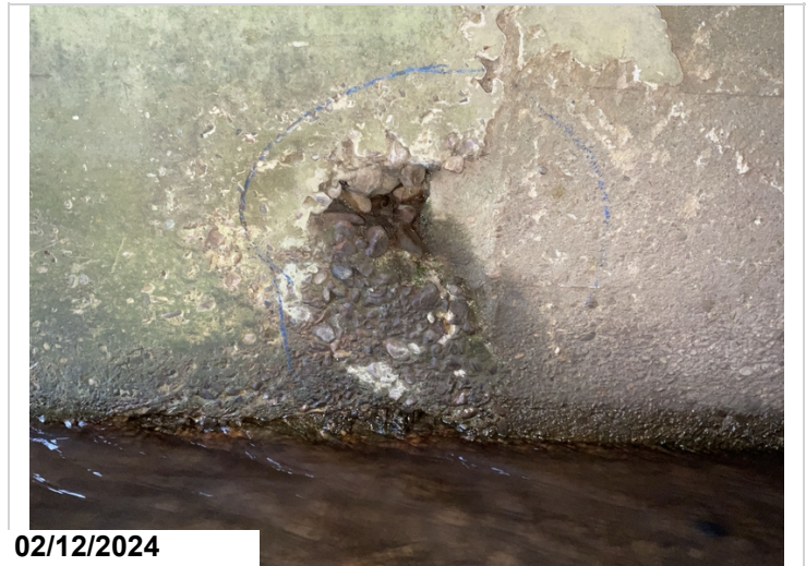
Barrel 2 spall. CS3