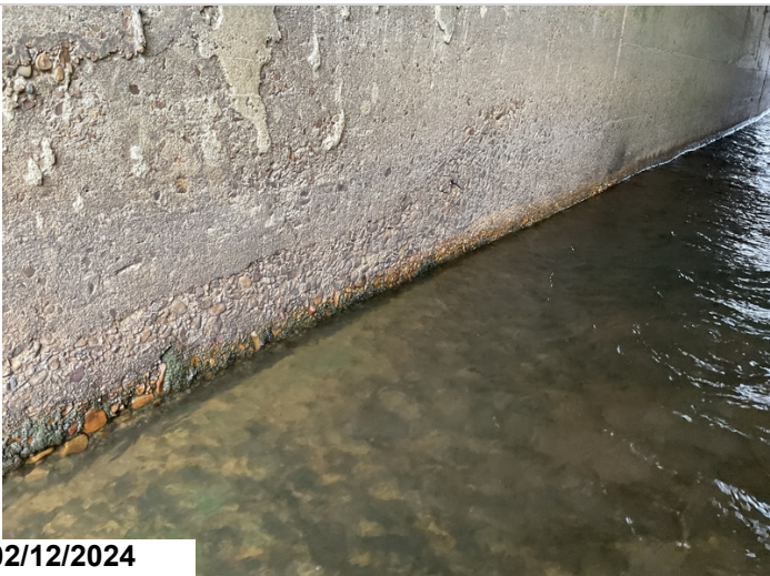
Barrel 1 abrasion. CS2